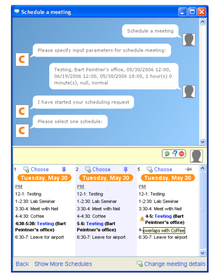
Figure 5. PTIME Schedule Selection Form

PTIME (Berry et al. 2006), which provides the scheduling component of CALO. These forms make it easier to handle the many optional parameters that scheduling can use and also help the user visualize scheduling alternatives and other participants' schedules.