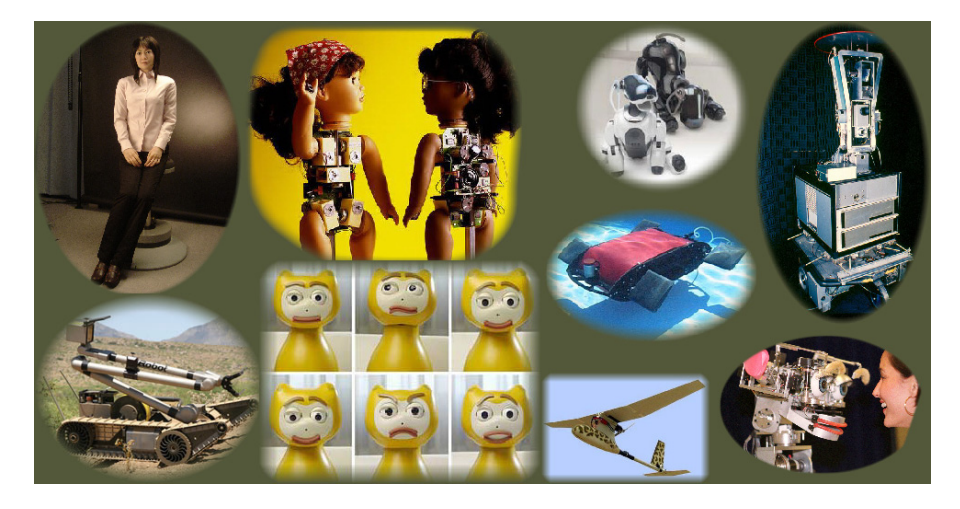
Fig. 4.1 Representative types of robots. In clockwise order beginning in the upper left: RepileeQ2 — an extremely sophisticated humanoid [136]; Robota — humanoid robots as "educational toys" [21]; SonyAIBO — a popular robot dog; (below the AIBO) A sophisticated unmanned underwater vehicle [176]; Shakey — one of the first modern robots [279]; Kismet — an anthropomorphic robot with exaggerated emotion [65]; Raven — a mini-UAV used by the US military [186]; iCAT an emotive robot [REF]; iRobot<sup>®</sup> PackBot<sup>®</sup> — a robust ground robot used in military applications [135]. (All images used with permission.)

trolled by a human (i.e., teleoperated), through the entity being completely autonomous and not requiring input or approval of its actions from a human before taking actions: