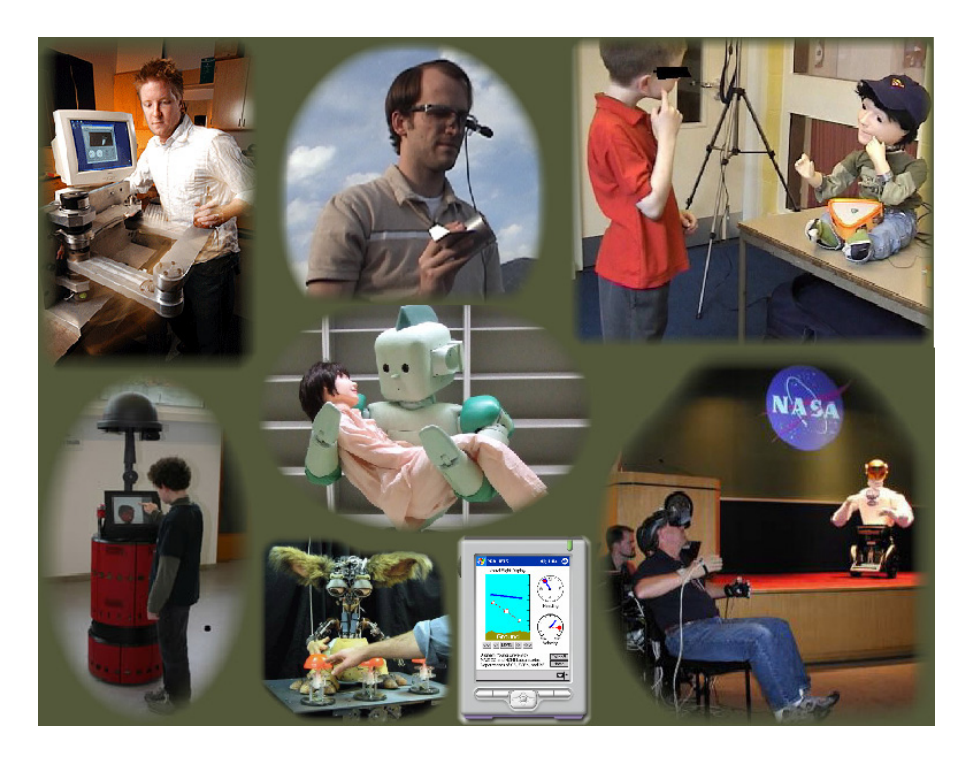
Fig. 4.3 Types of human–robot interaction. Counterclockwise from top left: haptic robot interaction from Georgia Tech [102], a "physical icon" for flying a UAV from Brigham Young University, peer-to-peer interaction with the robot Kaspar from the University of Hertfordshire [298], teleoperation of NASA's Robonaut [205], a PDA-based interface for flying a UAV from Brigham Young University, gesture- and speech-based interaction with MIT's Leonardo [189], a touchscreen interaction with a Cogniron robot [169], and (center) physical interaction with the RI-MAN robot [24]. (All images used with permission.)