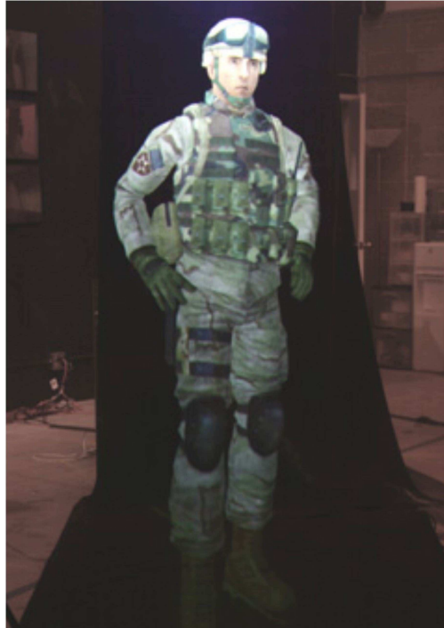
Fig. 3. Sergeant Blackwell Question Answering Character

Sgt Blackwell, shown in Figure 3, is described more fully in [13, 14]. Sgt Blackwell was designed as a technology demo exhibit for a conference. His speech model was designed for limited domain and three specific demonstrators. Sgt Blackwell's dialogue model includes a set of answers constructed ahead of time. These answers are in three categories, (1) "in domain answers", which are simple answers to questions, (2) "off-topic" answers, which are a set of responses to give when there is no appropriate in-domain answer, such as "I don't know" or "why don't you ask someone else", and (3) "prompts", to direct questioners back to the proper domain. The information state is very simple, and consists only of the local history of the last few utterances, and two thresholds: one for avoiding duplication of in domain answers (when possible), and a second threshold for avoiding repetition of off-topic answers. There is also a translation model mapping a language model for questions to a language model for answers, use to score each answer as to how well it addresses a new input question. This allows both high confidence on known questions as well as robustness to speech recognition errors and other small differences in asking the question.