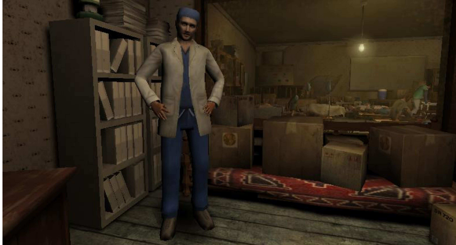
Fig. 7. SASO-ST VR clinic and virtual human doctor

As in the MRE project, we started with a simple version of the character that was suitable for demo users. The initial version was built very quickly, reusing over 80% of the programming of the MRE characters. By using this version to collect data with test subjects, as well as conducting additional role-play and wizard of oz data, we were able to more than double performance of the recognition components and reach a level where users have satisfactory experiences in which their success or failure has more to do with their negotiating tactics than ability to use the system.