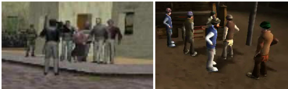
Fig. 4. Examples of Simulated Group Conversation

We have also been working on Group conversation characters, to serve as background characters for larger virtual simulations. These characters are not meant for direct interaction with users, but to serve as a middle level of detail [15]. Their behavior should be natural for a crowd, engaged in conversational interactions, and allow for natural variation for extended durations. We based this work on the conversation simulation of [16].