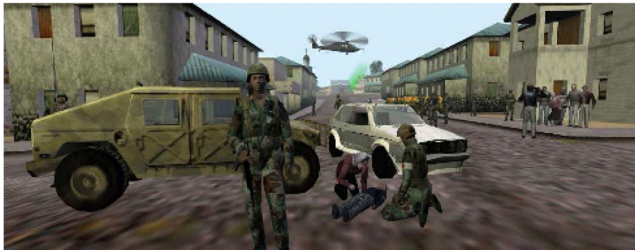
Fig. 5. An interactive peacekeeping scenario featuring (left to right in foreground) a sergeant, a mother, and a medic.

So far we have evaluated these characters with respect to believability, fidelity of inferences from observed behavior to guiding parameter.